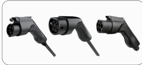
Type 1, Type 2, GB/T