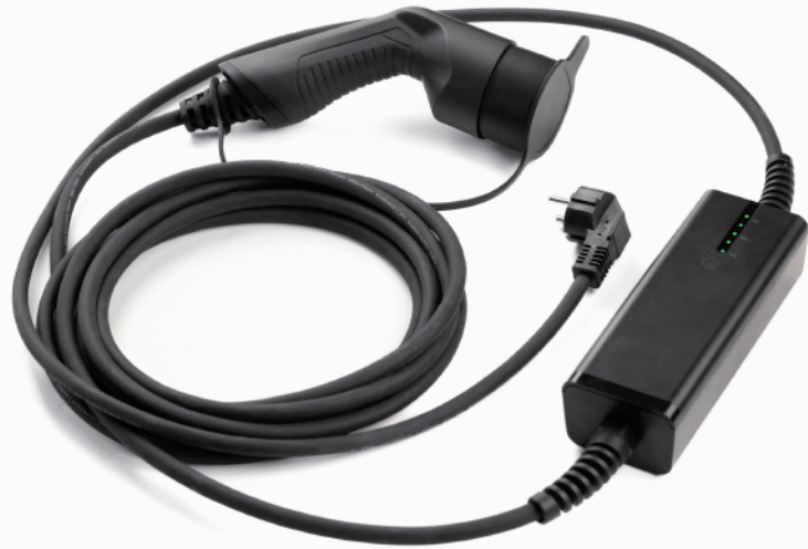
BN20 Low power(8A-16A)